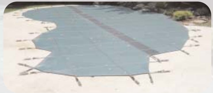
Even with major obstructions and limited deck, the PermaGuard Solid Cover above, lays taught and ready to drain. PermaGuard Solid Covers without the built in drain are also available.